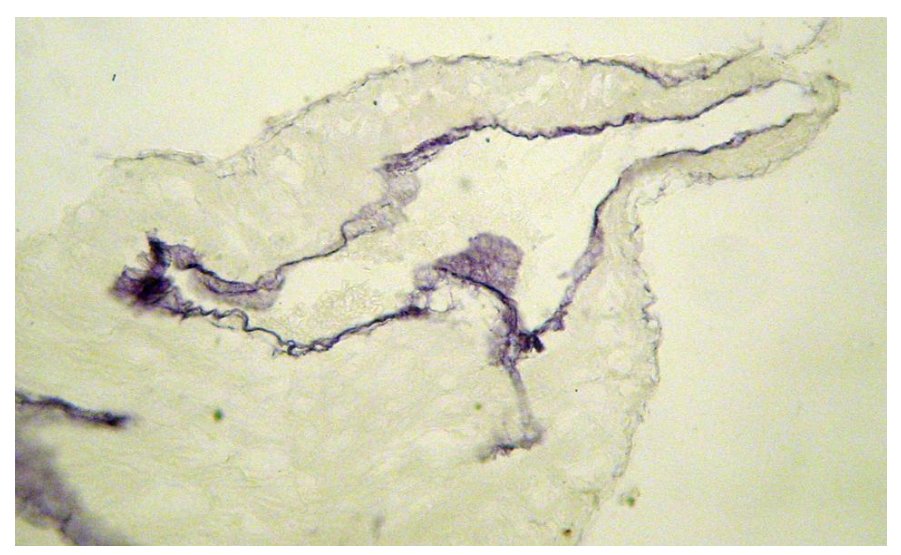
Picture 3.Elastic fibers in the inner layer of the vascular wall of the nucleus accumbens. Dye: Weigert method. X:10x40.