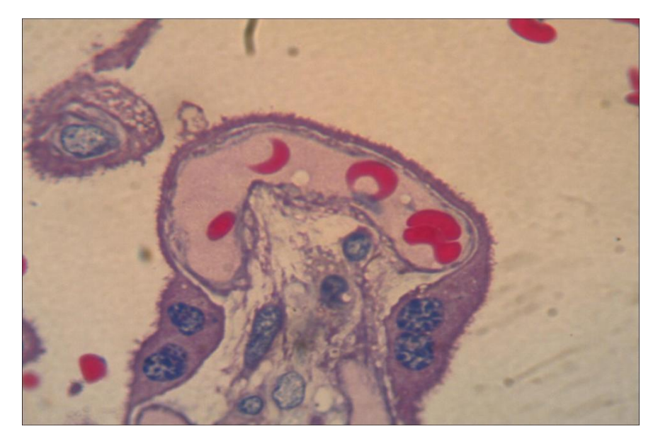
Picture 4.Appearance of the hemato-trophoblast boundary in a semi-thin section. Dye: toluidine blue. X: 10x40.

Evaluation of nonspecific involutional changes of the satellite.In the assessment of nonspecific involutional changes in placental tissue over time, attention should be paid to fibrinoids, calcinosis, sclerosis, possible intravascular thrombosis, infarct foci in placental tissue, which appear in the stroma and vascular wall of the placenta. In addition, immunomorphological reactions develop in the placental tissue, and the stroma and vascular wall may be infiltrated by lymphocytes, macrophages, plasma cells, and leukocytes.In microscopically studied normal placental tissue, fibrinoid edema, a process of stroma-vascular protein dystrophy, was observed to occur initially and in most cases in the stroma of the central mammary glands and in the vascular wall in them. When the composition of such foci was studied by staining by the histochemical method - SHIK reaction, it was found that they accumulated dark purple-stained sour glycosaminoglycans and coarse protein fibrinoids. In the stroma of some terminal suckers, fibrinoids were observed to be very rare in the stroma, i.e., only in the area of the basement membrane, the fibrous structures underwent small-focal fibrinoid swelling.