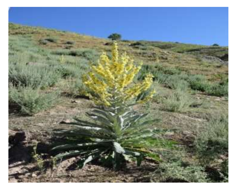
Figure 1. Verbascum songoricum Schrenk plant in bloom

We isolated amides of acids three alkaloids: anabazin (1), plantagonine (2), indicaine (3) and 4 amides: acetamide (4), benamide (5), cinnamon (6) isoferul (7) acids as a result of the solubility of this mixture of alkaloids and being in a silica gel column. Anabasine was first isolated from a plant belonging to the cowtail family Scrophulariaceae.